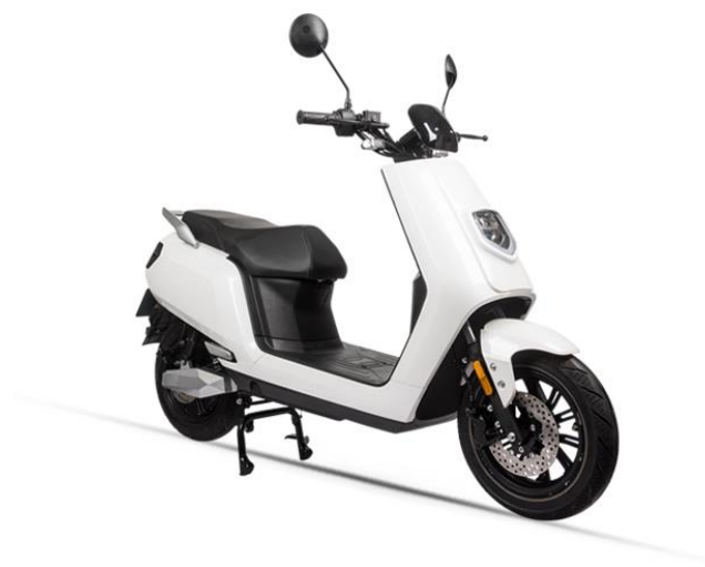
Model no .S5